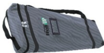
Carrying case A padded case of tough, sturdy material with strap and handle.